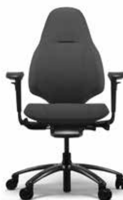
RH MERO 220 BLACK