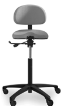
RH SUPPORT SADEL