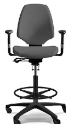
RH ACTIV 222