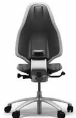
RH MERO 220 SILVER