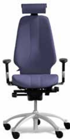
RH LOGIC 400