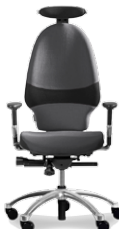
RH EXTEND 120