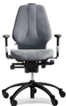
RH LOGIC 300 COMFORT