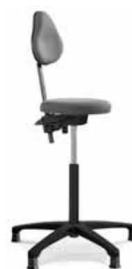
RH SUPPORT ALTERNATIV