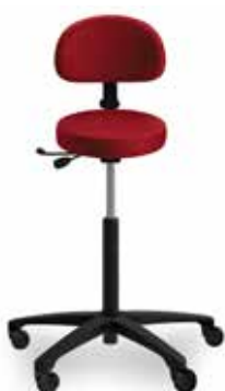
RH SUPPORT TABURETT