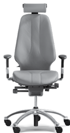
RH LOGIC 400 ELEGANCE