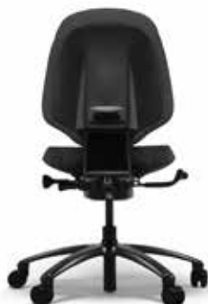
RH MERO 200 BLACK