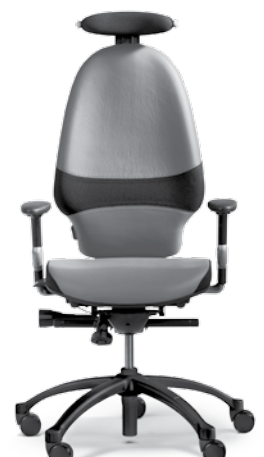
RH EXTEND 220