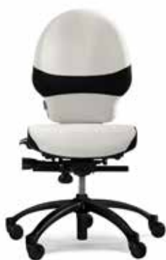
RH EXTEND 100