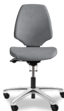
RH ACTIV 220