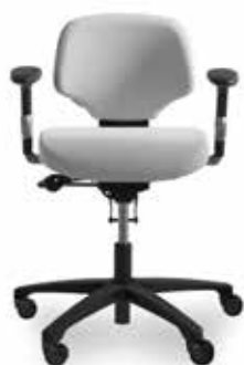
RH ACTIV 200