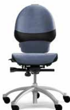
RH EXTEND 200