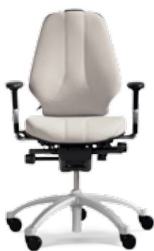
RH LOGIC 300