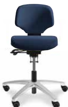
RH ACTIV 202