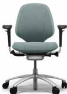
RH MERO 200 SILVER