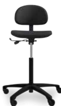
RH SUPPORT LIMPAN